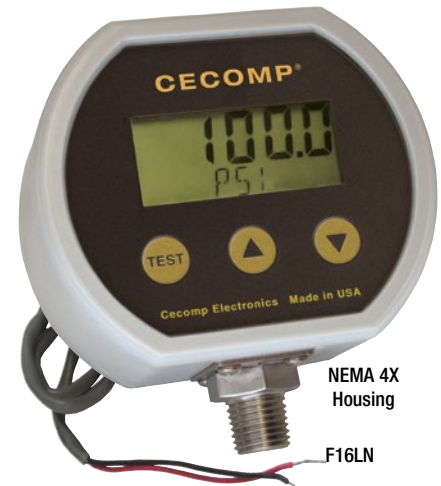
NEMA 4X Housing