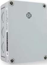
Wall Mount Without LCD