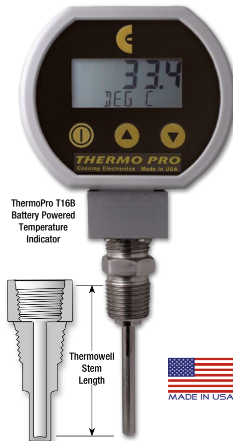
ThermoPro T16B Battery Powered Temperature Indicator

See thermowell manufacturer's specifications. Probe length is measured from top of full threads to tip of probe.